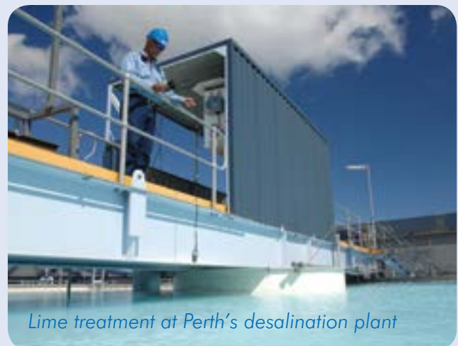
Lime treatment at Perth's desalination plant

It uses the same desalination technology and the same treatment processes that are being used at Victoria's new desalination plant.